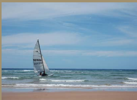
Hobie in the bay