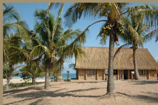
House from the rear